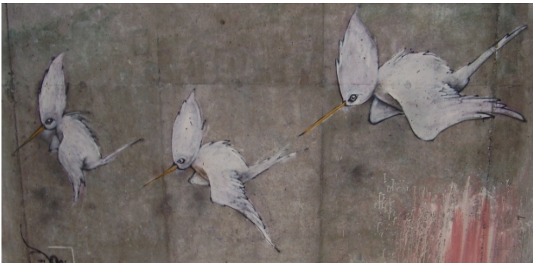
The bridge to Lilla Essingen