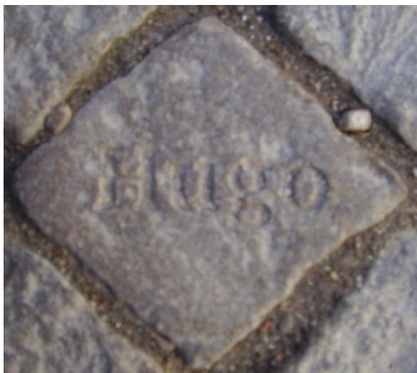
Pavement brick at Tessinparken