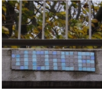
Bridge in the Rålambshov park