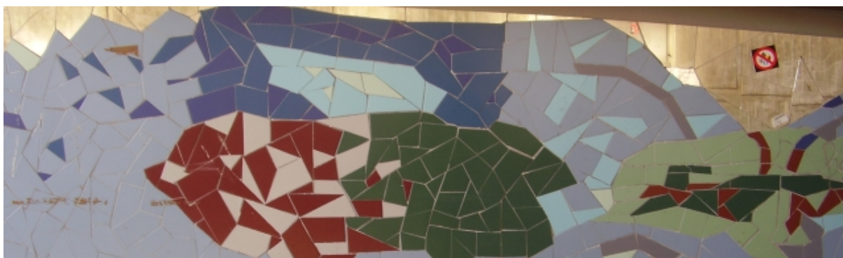
Walking path along Bergsundsstrand